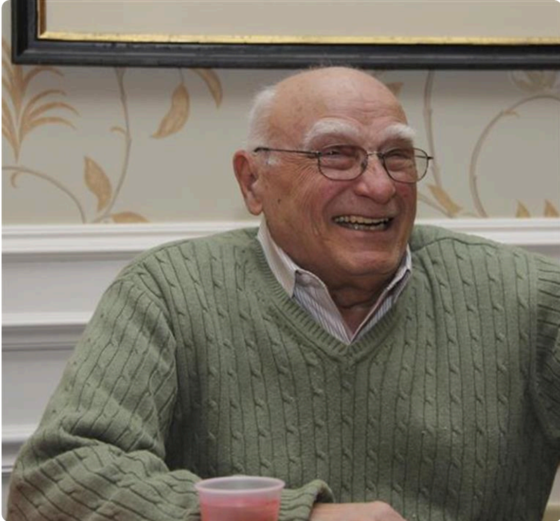
Remembering that great smile.